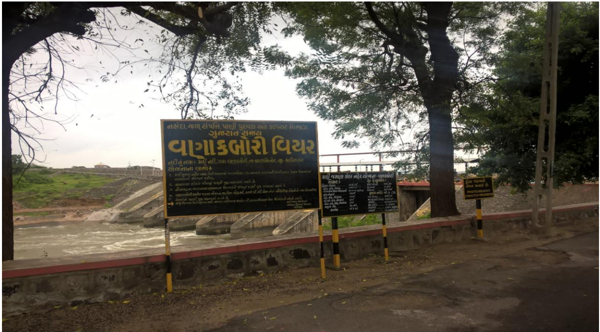
At TPS, Wanakbori....